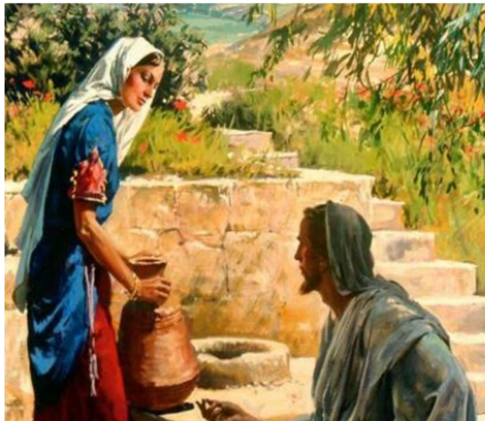
The Samaritan Woman at the Well